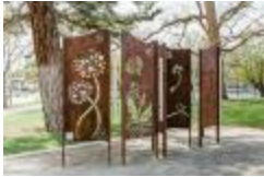
A Life Cycle Story (2021.3.1)